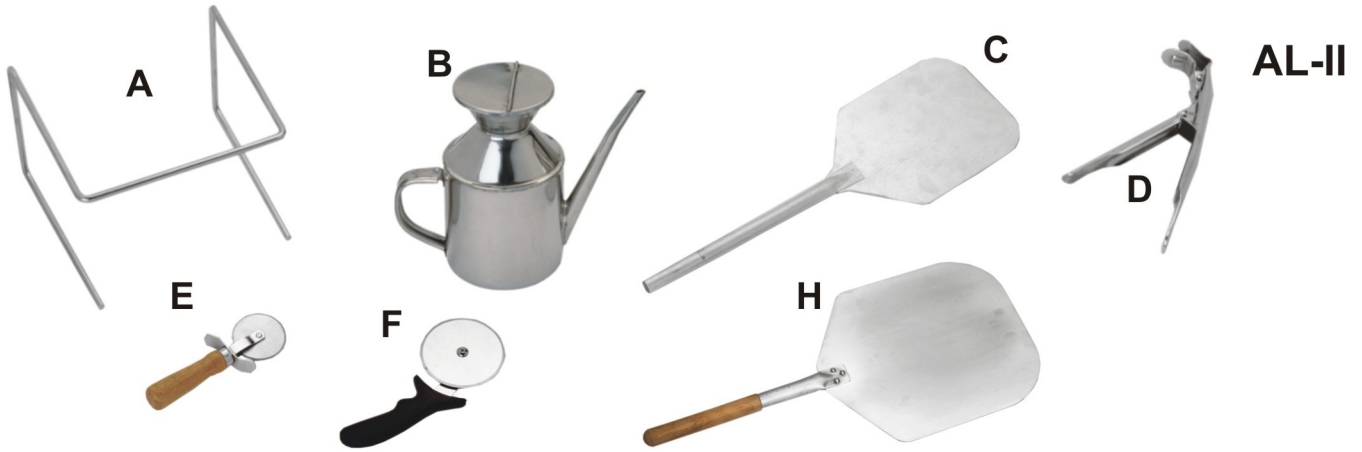
A) Pizza Tray Wire Stand St. Steel B) Oil Can C) Pizza Peel 7" X 9" Blade 21" Long Aluminium