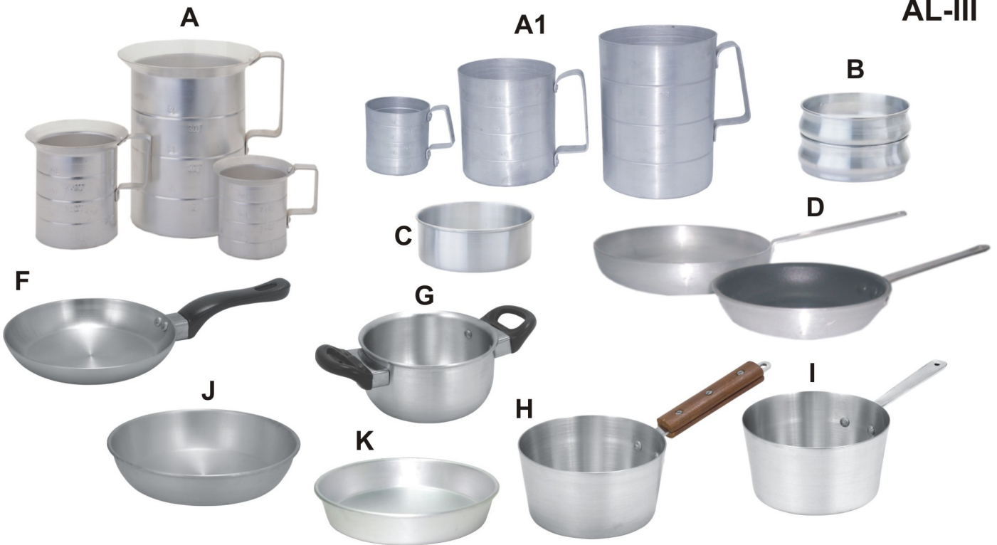
A) Aluminium Measurers 1/2, 1, 2, 4 Qt A1) Dry Measures 1/2, 1, 2 & 4 Qt B) Dough Retarding / Proofing Pans C) Deep Straight Pan 8" X 2", 8" X 3", 10" X 2", 10" X 3", 12" X 2", 12" X 3"