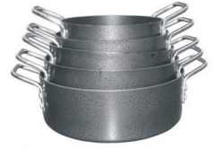
ALUMINIUM BRAZIERS HARD ANODIZES