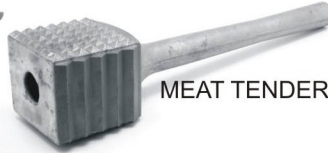
MEAT TENDERIZER HOLLOW